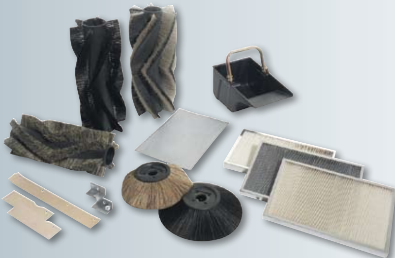
Large range of optional accessories provides the right tools for specific jobs e.g. carpet kit, special filters and brushes, overhead guard, 2x18 litres hopper containers etc.