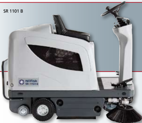
SR 1101 B

Light debris in corners or above floor level can be quickly collected with the remote on-board vacuum system.