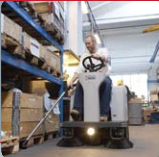
Light debris in corners or above floor level can be quickly collected with the remote on-board vacuum system