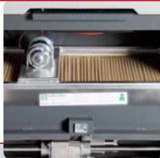
An electrical filter shaking system cleans the filter automatically every 5 minutes