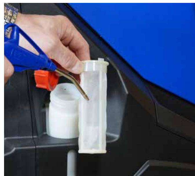
3. Rinse the fuel filter with compressed air.