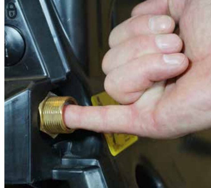
3. Remove the filter from the filter housing.