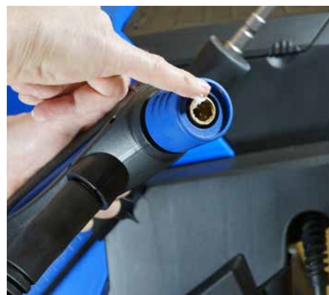
2. Grease the quick coupling of the spray handle.