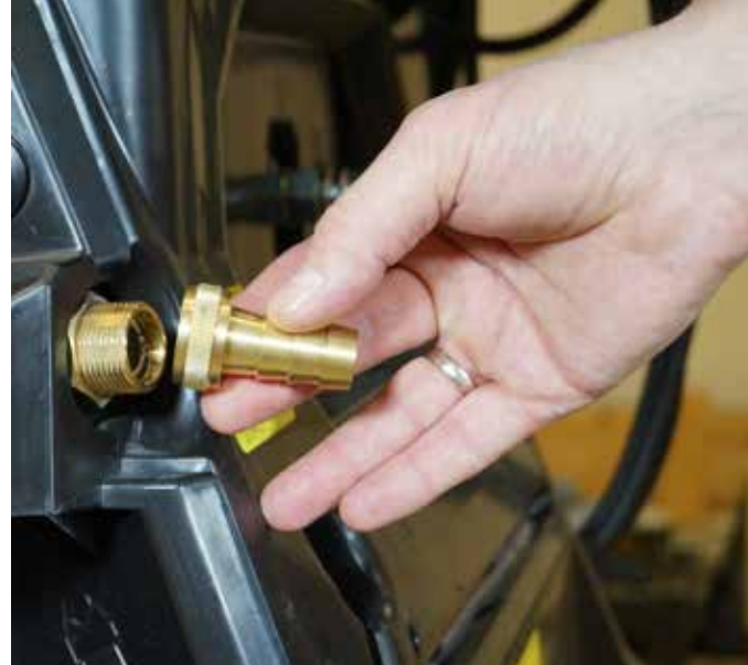
1. Remove the water inlet nipple.