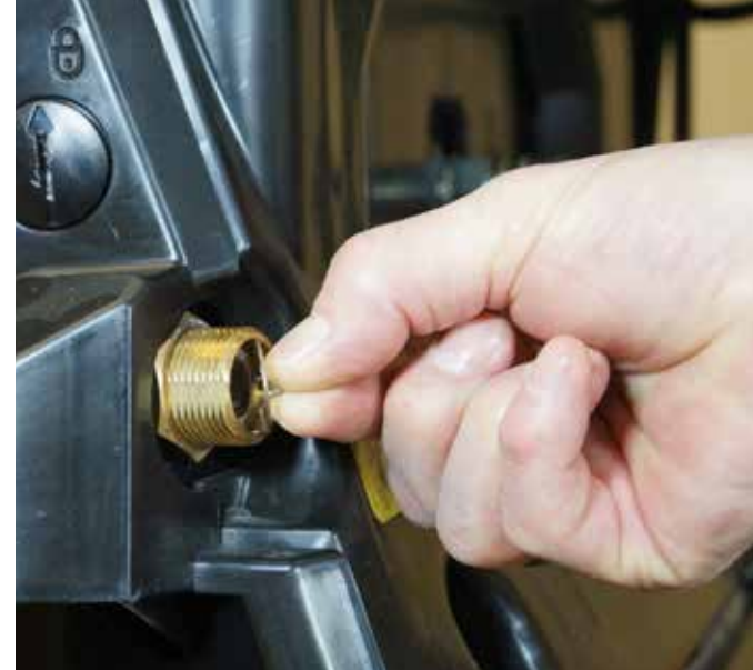
2. Remove the lock ring for the filter.