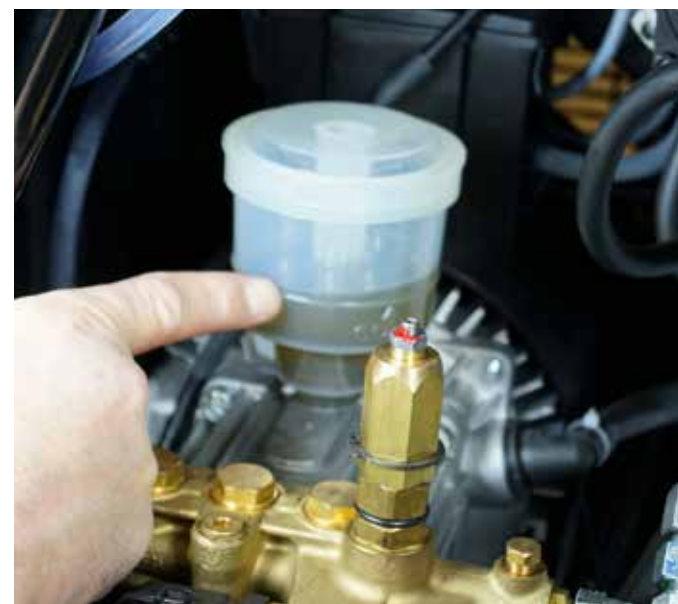
2. The oil level must be above min. level mark.