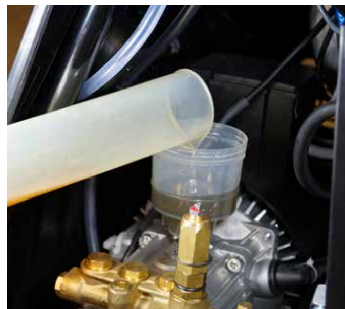
3. Refill oil if needed.