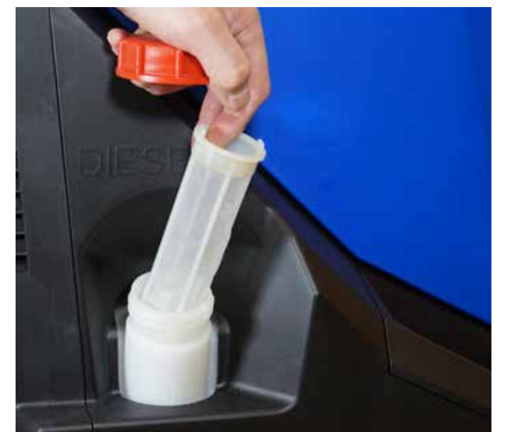
4. Reinstall the fuel filter and close the lid.