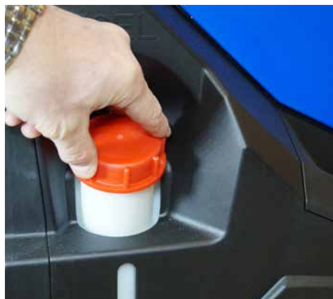
1. Remove the lid from the fuel tank.