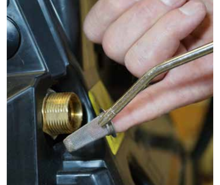
4. Rinse filter with compressed air or water.