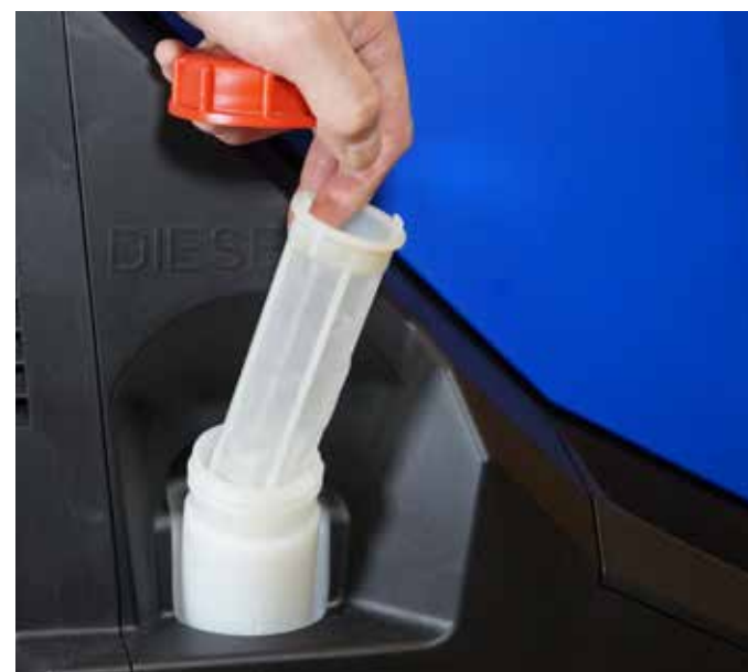
2. Pull up the fuel filter from the fuel tank.