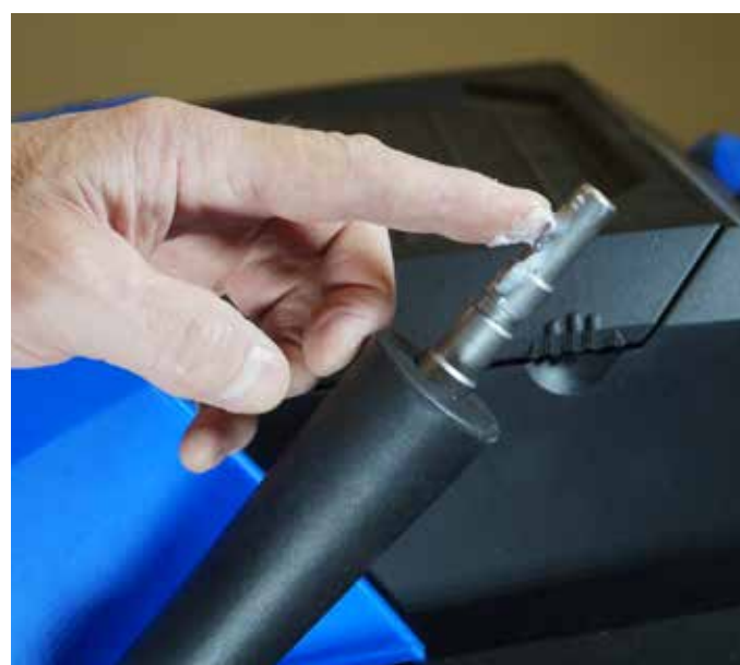
1. Grease the nipple on the lance.