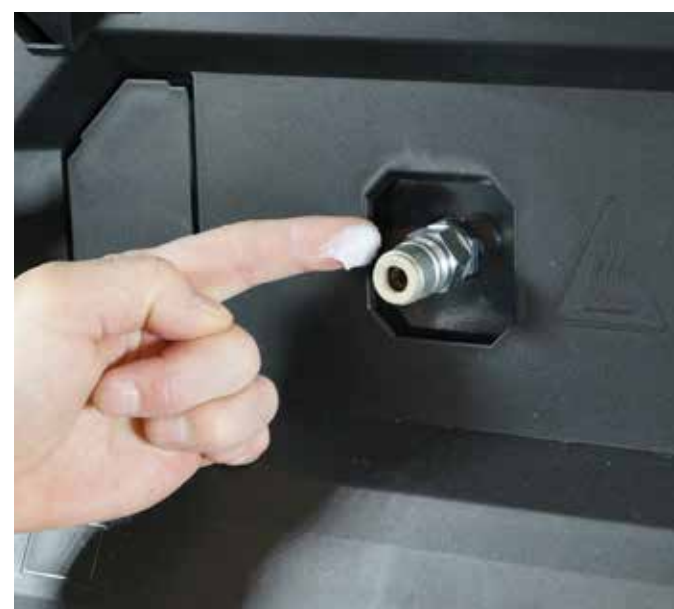
3. Grease the water outlet nipple.